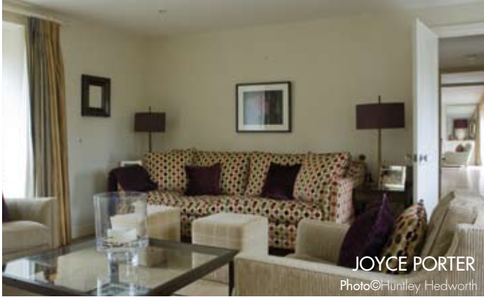
JOYCE PORTER